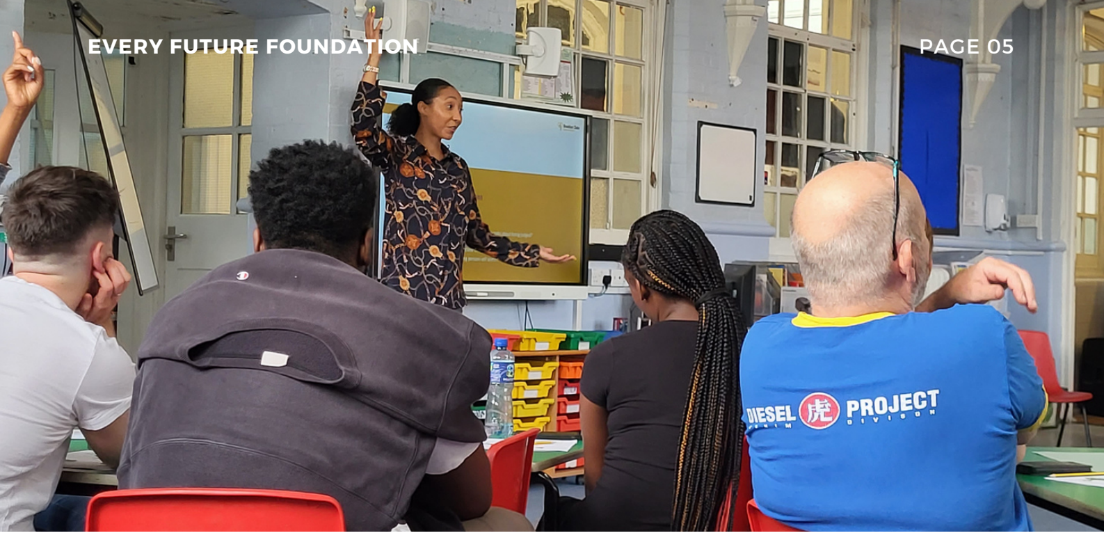
2 Hour Module